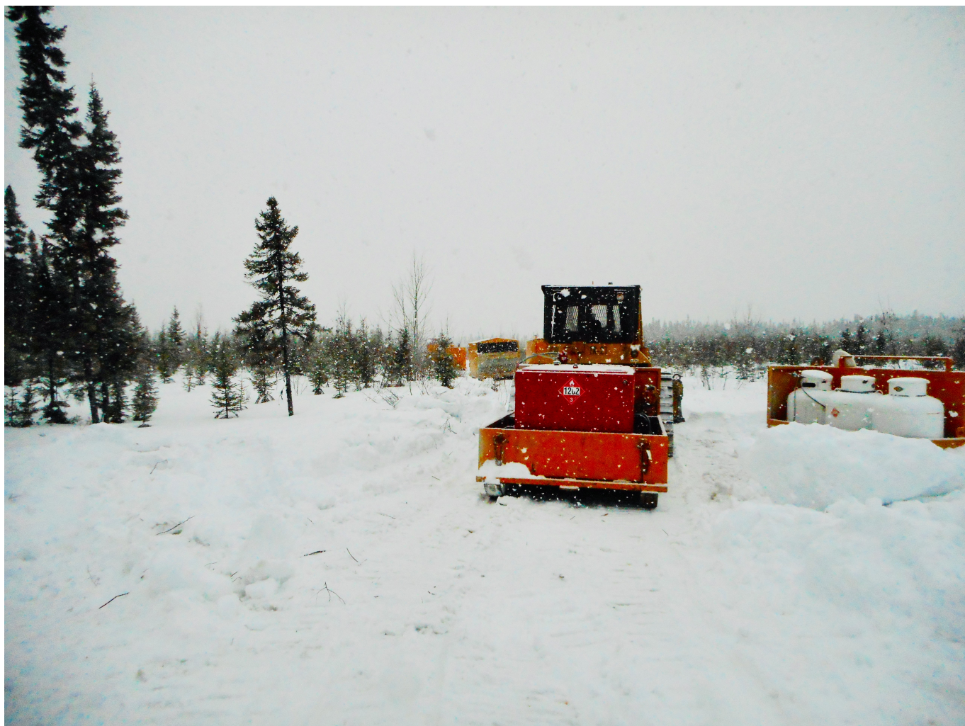
Fig. 2: Third drill rig and equipment being mobilized to the Exploration Target area at Douay

true geologically. The green dots in Fig. 1 represent drill collars for the new drill-holes set to commence at the Exploration Target.