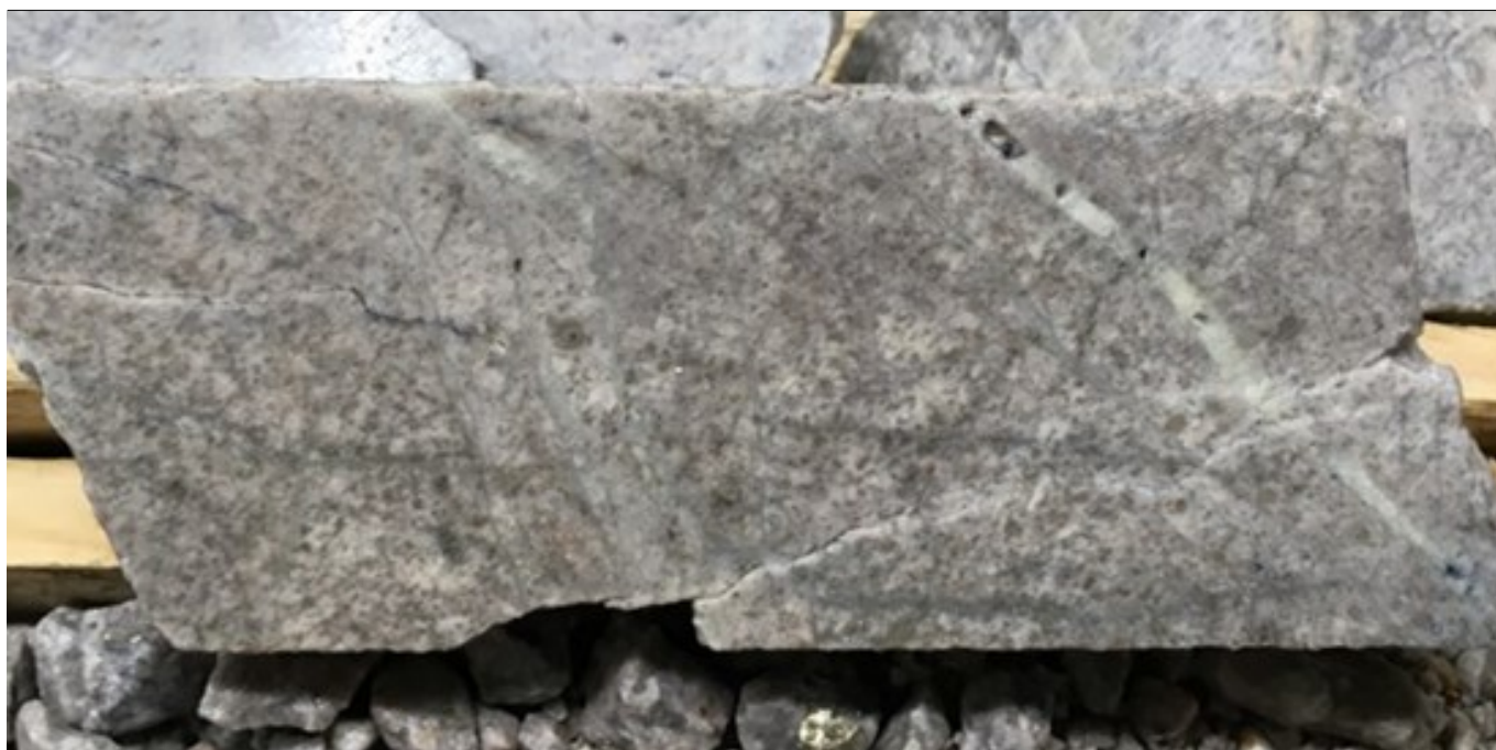
Fig. 3: NQ core (47.6mm diameter) from 203-204m downhole in DO-20-283; that interval assayed 5.25 g/t Au. Both disseminated and veinlet pyrite are present in bleached syenite. Photo is of a selected interval and is not necessarily representative of all mineralization hosted on the property.

The new assay results from DO-20-280 and DO-20-283 support the presence of multiple mineralized gold zones within the top 50-250 metres vertically in the western part of the Porphyry Zone, above or at the current base of conceptual pits that are relatively shallow in this area, and provide support for near-surface upside in this relatively sparsely drilled area on the north side of the Porphyry Zone.