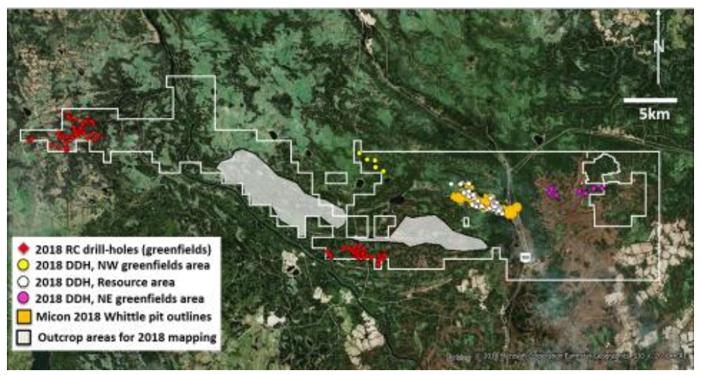
Figure 3 – 2018 Drill plan on LIDAR base map

Results from the 2018 winter drilling program, which are still being received for the greenfields areas, will help identify mineralization vectors and substantively improve geological and geostatistical modelling of the Douay Mineral Resources. Sample assaying continues at ALS Laboratory Group facilities.