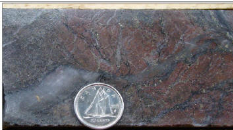
Fig. 3A: Altered hematitic and pyritic syenite with quartz veinlets in highest grade portion of D0-18-247. Note speck of visible gold to the left of the dime.