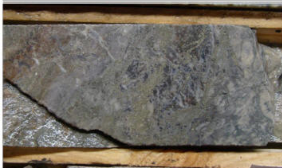
Fig. 3B: Drill-core from D0-18-254 pictured above - bleached and strongly pyritic syenite