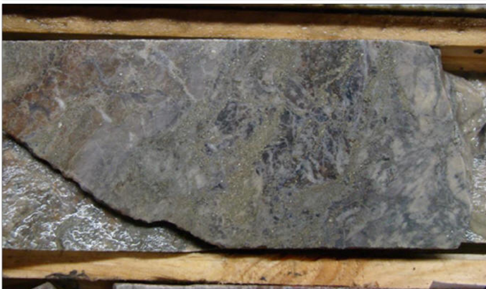
Fig. 3B: Drill-core from DO-18-254 pictured above - bleached and strongly pyritic syenite

To view an enhanced version of this graphic, please visit: https://orders.newsfilecorp.com/files/3077/35775_Maple2.jpg