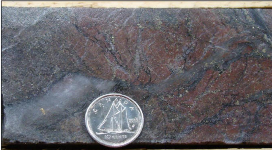
Fig. 3A: Altered hematitic and pyritic syenite with quartz veinlets in highest grade portion of DO-18-247. Note speck of visible gold to the left of the dime.