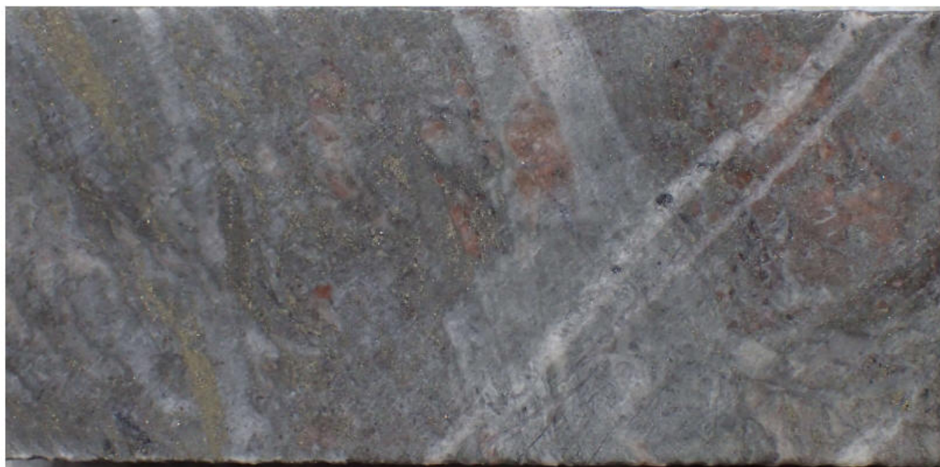
Figure 2: Sample of strongly altered and pyritised basalt with syenite fragments in interval grading 9.74 g/t Au; field of view 47.6mm.

To view an enhanced version of this graphic, please visit: https://orders.newsfilecorp.com/files/3077/46178_maple4.jpg