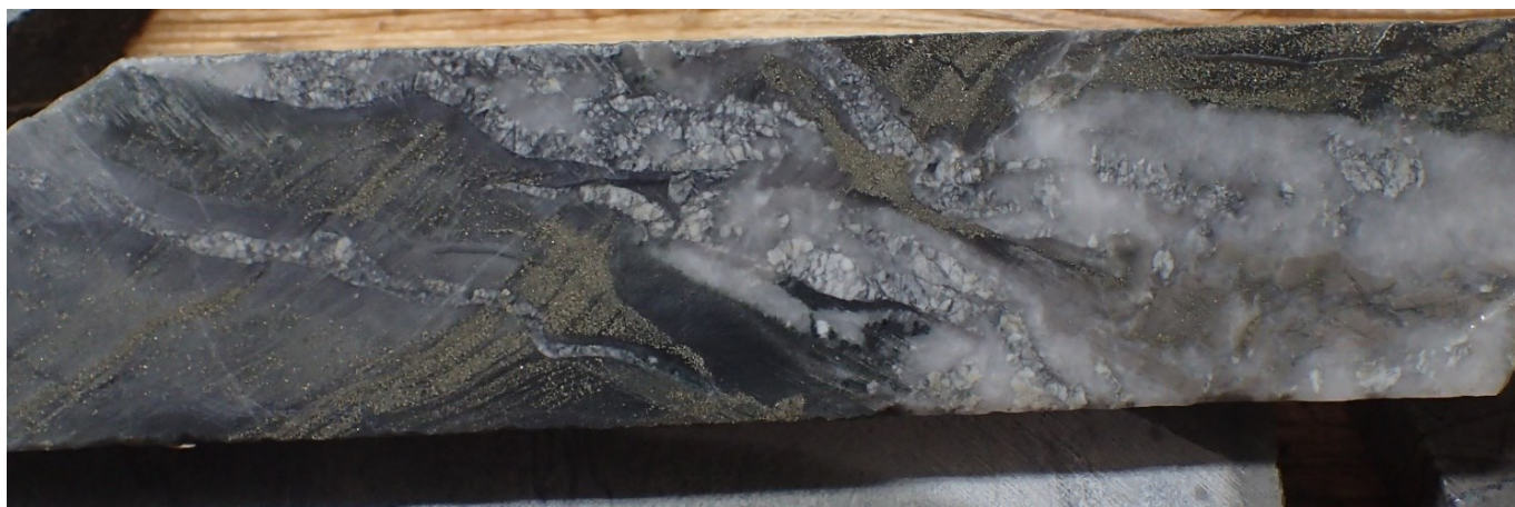
Plate 1: Drill core from EM-22-009 at 991.3m; sedimentary interval within microgabbro unit, in

Phase III drilling at Eagle, which is expected to commence in Q4/2022, will follow-up not only on the best results of the first two drilling phases, but also on the results of previous downhole electromagnetic ("EM") surveys, on ranked airborne EM targets from the recently completed Mag-EM survey (see news from July 19, 2022), and on a recently completed high-resolution drone magnetic survey.