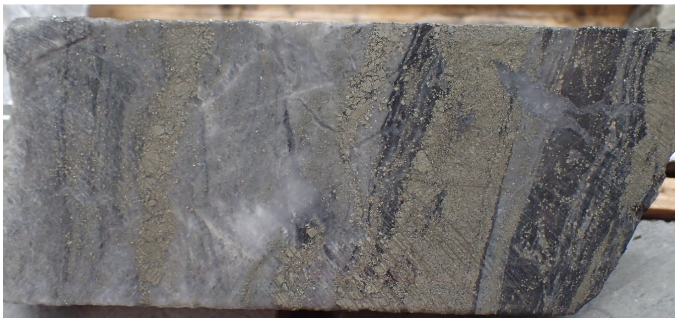
Plate 2: Mineralized interval within sample from 992-993m that graded 24.4 g/t Au, in mixed altered microgabbro (left side) and sediment (right side).

https://images.newsfilecorp.com/files/3077/133804_eb5f1762b4c0fb99_003full.jpg