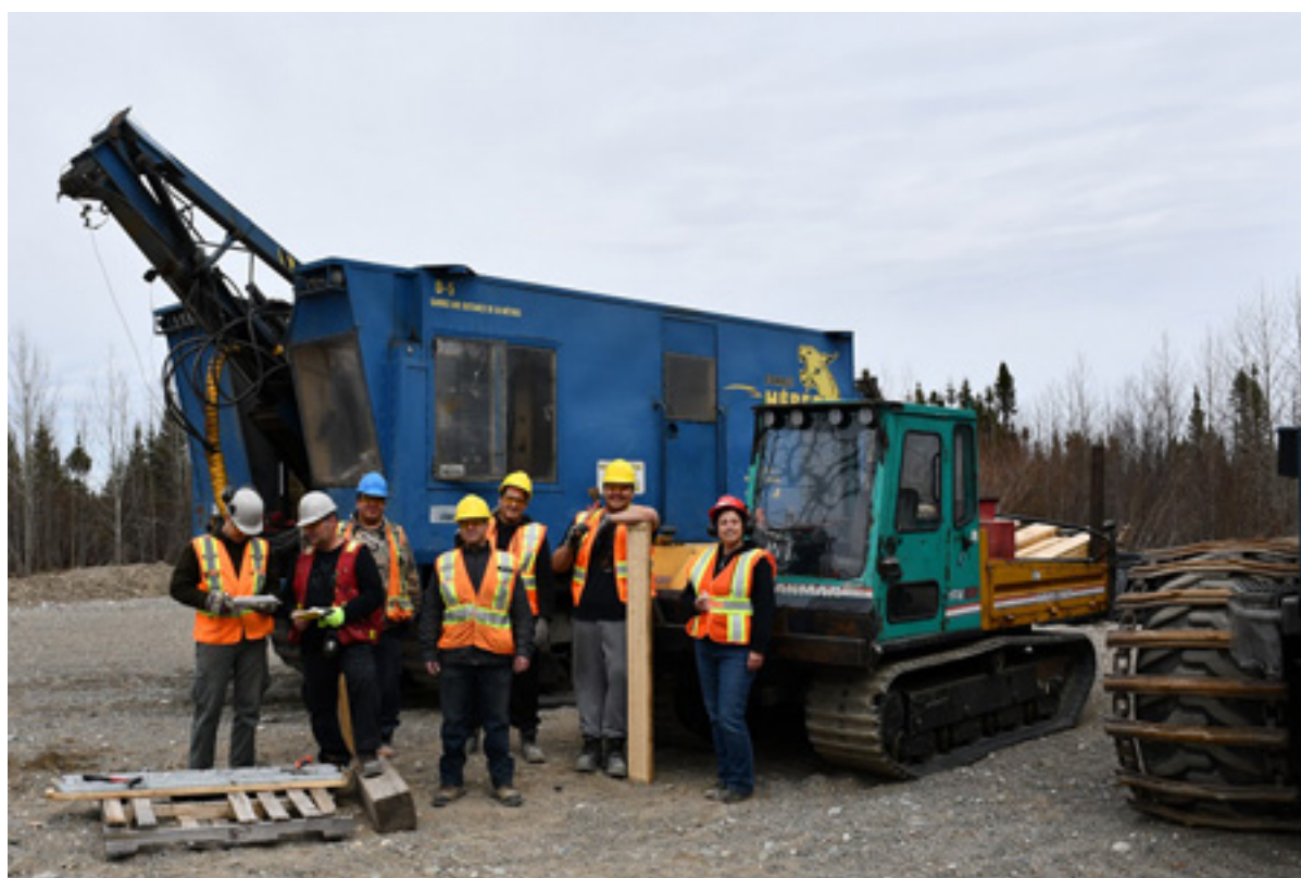
Pictured above: Project Manager, Geologists and Technicians at Douay