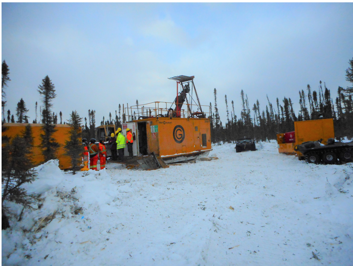
Fig 1: Instrument training/induction meeting at first drill-site; Orbit Garant at the Nika Zone

Montreal, Quebec--(Newsfile Corp. - March 29, 2019) - Maple Gold Mines Ltd. (TSXV: MGM) (OTCQB: MGMLF) (FSE: M3G) ("Maple Gold" or the "Company") has officially commenced drilling with Orbit Garant's first drill rig, currently at a depth of 125m downhole (see Fig 2 to view drill-core) at the first drill site in the Nika Zone. This first drill-hole, DO-19-255, is targeting the near-surface extension of last' year's best intercept in the Nika Zone (hole DO-18-218), which returned 50 metres averaging 1.77 g/t Au (see press release dated May 14, 2018). The second drill-hole will test the depth continuity of the same intercept, with additional holes planned in this area to test other nearby higher grade targets.